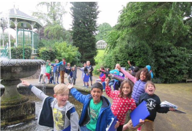
Year 4 at the Botanical Gardens last summer

If you can, please send the full amount requested. Thank you