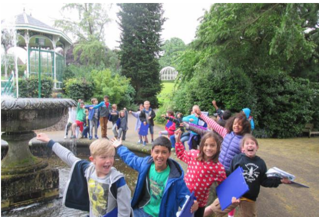
Year 4 at the Botanical Gardens last summer